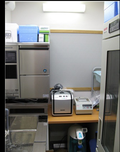
System for genome sequence analysis